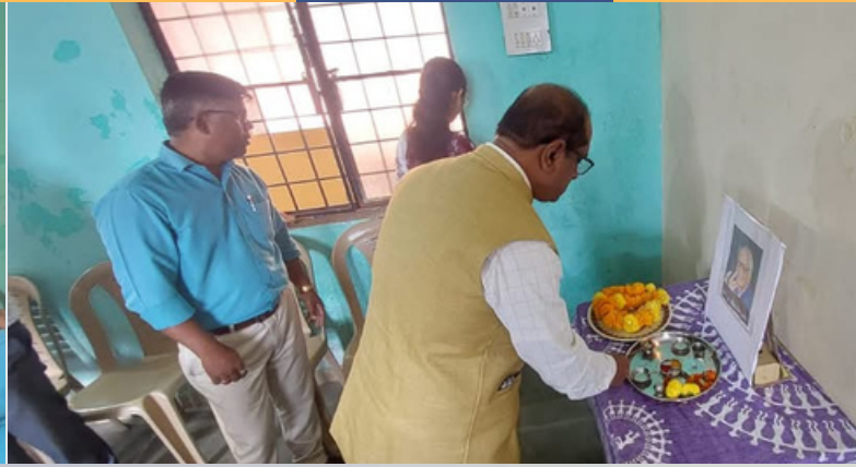
MARATHI BHASHA DIN (27TH FEBRUARY 2025)