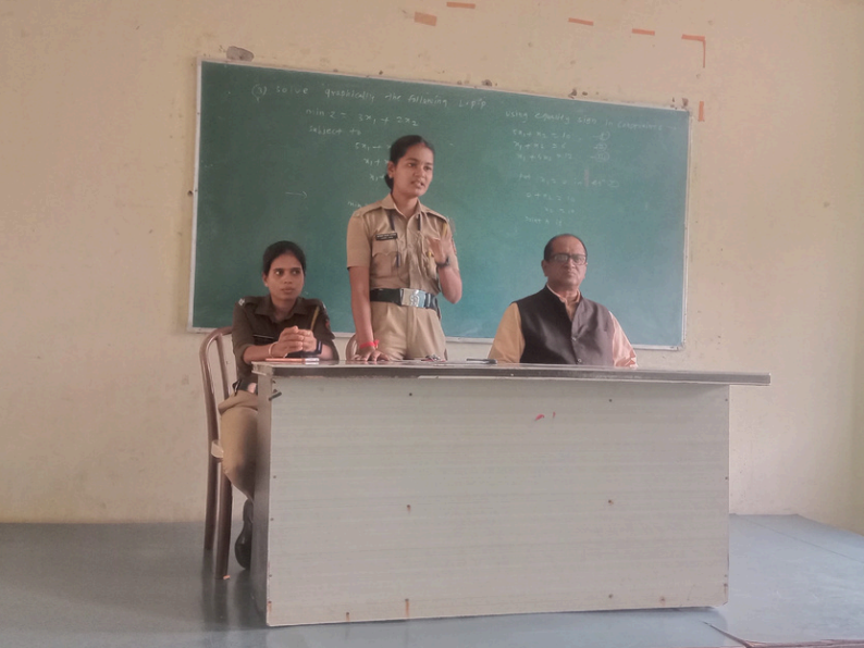
GUIDANCE LECTURE ON WOMEN'S SAFETY AT MAHARSHI KARVE MODEL COLLEGE, SHRIVARDHAN (08TH FEBRUARY 2025)