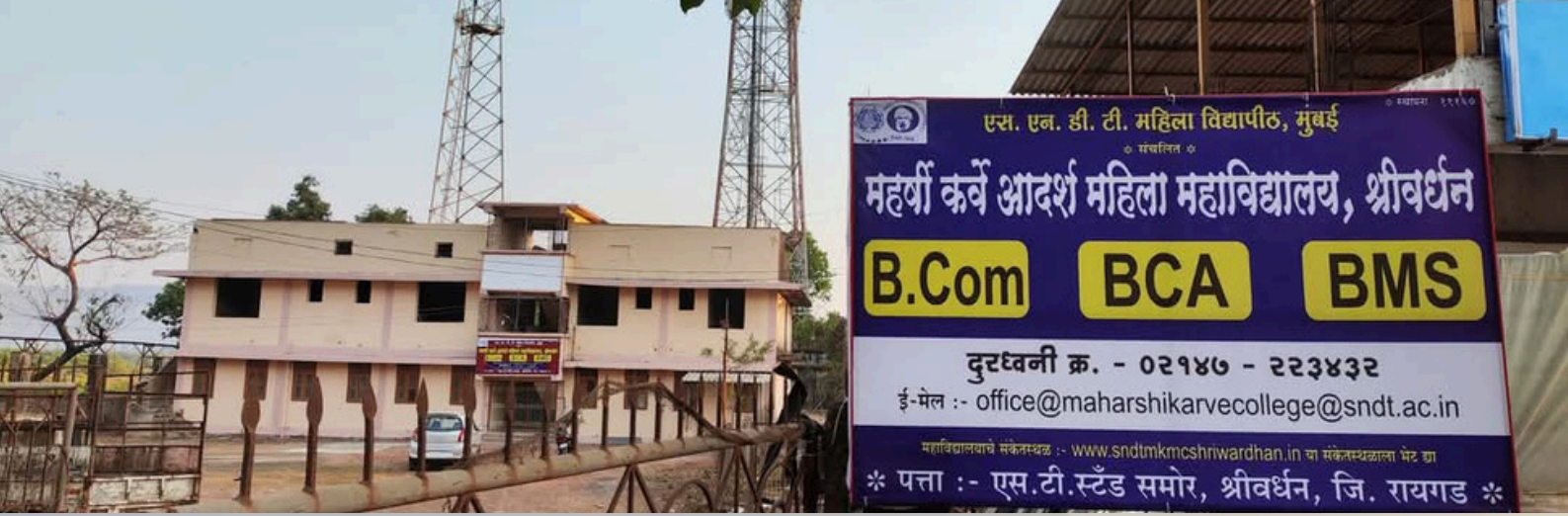
COLLEGE NEW BUILDING NEAR SHRIVARDHAN ST STAND (15TH FEBRUARY 2025)